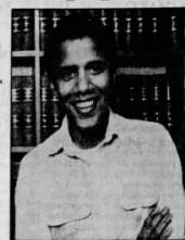
IN CAMBRIDGE, MASS.: Barack H. Obama was named Harvard Law Review president in February.